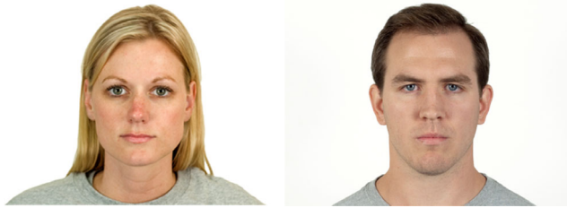
Figure 1. Two examples of the 100 pre-tested photographs retrieved from the Chicago Face Database (Ma et al., 2015) and employed in Studies 1–3.

As a first step, we ran a pre-study to: (1) select 50 photographs each of men and women matched on ratings of competence, dominance, morality, sociability, and attractiveness; and (2) obtain ratings of facial stereotypic qualities to use as independent variables in our studies. We chose the 183 (93 men and 90 women) photographs depicting White faces from the Chicago Face Database (Ma, Correll, & Wittenbrink, 2015), as this is the majority ethnic group in the United Kingdom (where the studies were conducted), and to avoid ethnicity as an additional source of variation (e.g., see Sutherland et al., 2018, on ethnic differences in face perception). The individuals depicted in the photographs had uniformly neutral expressions, and all wore grey t -shirts (see Figure 1).